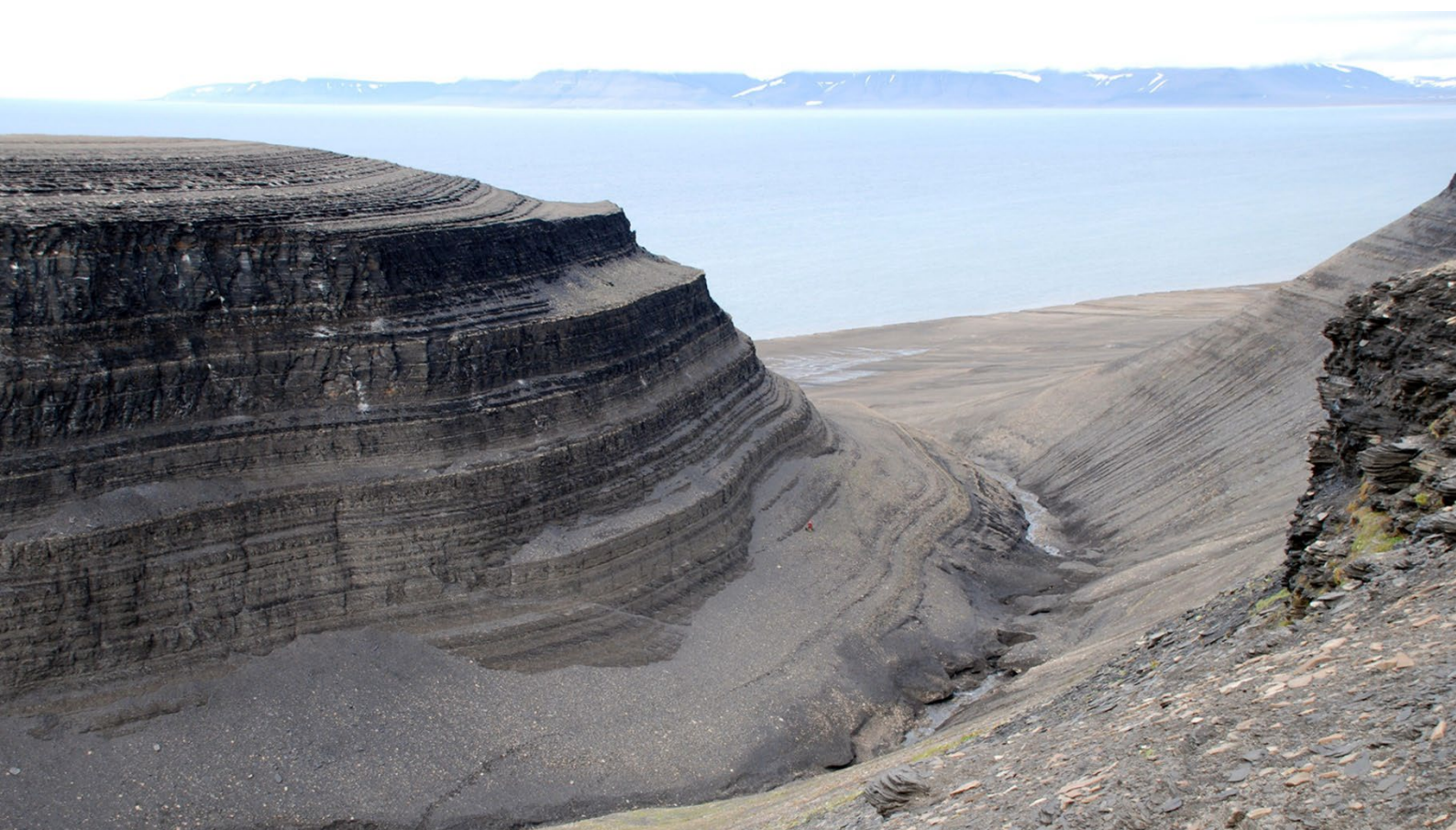
Photo of Edge Island with outcropping Triassic source rock of the Steinkobbe-/Botneheia Formation.